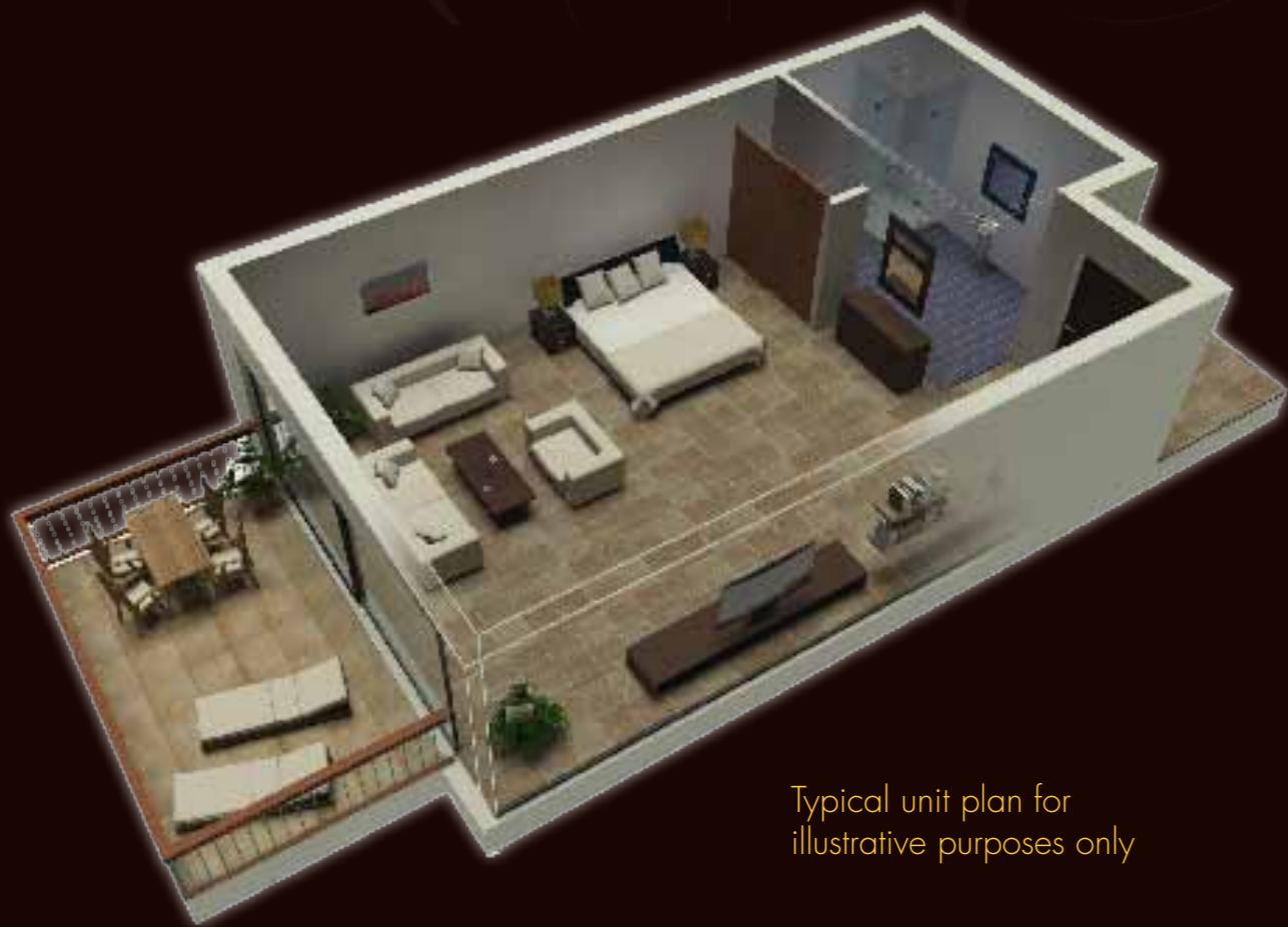
Typical unit plan for illustrative purposes only